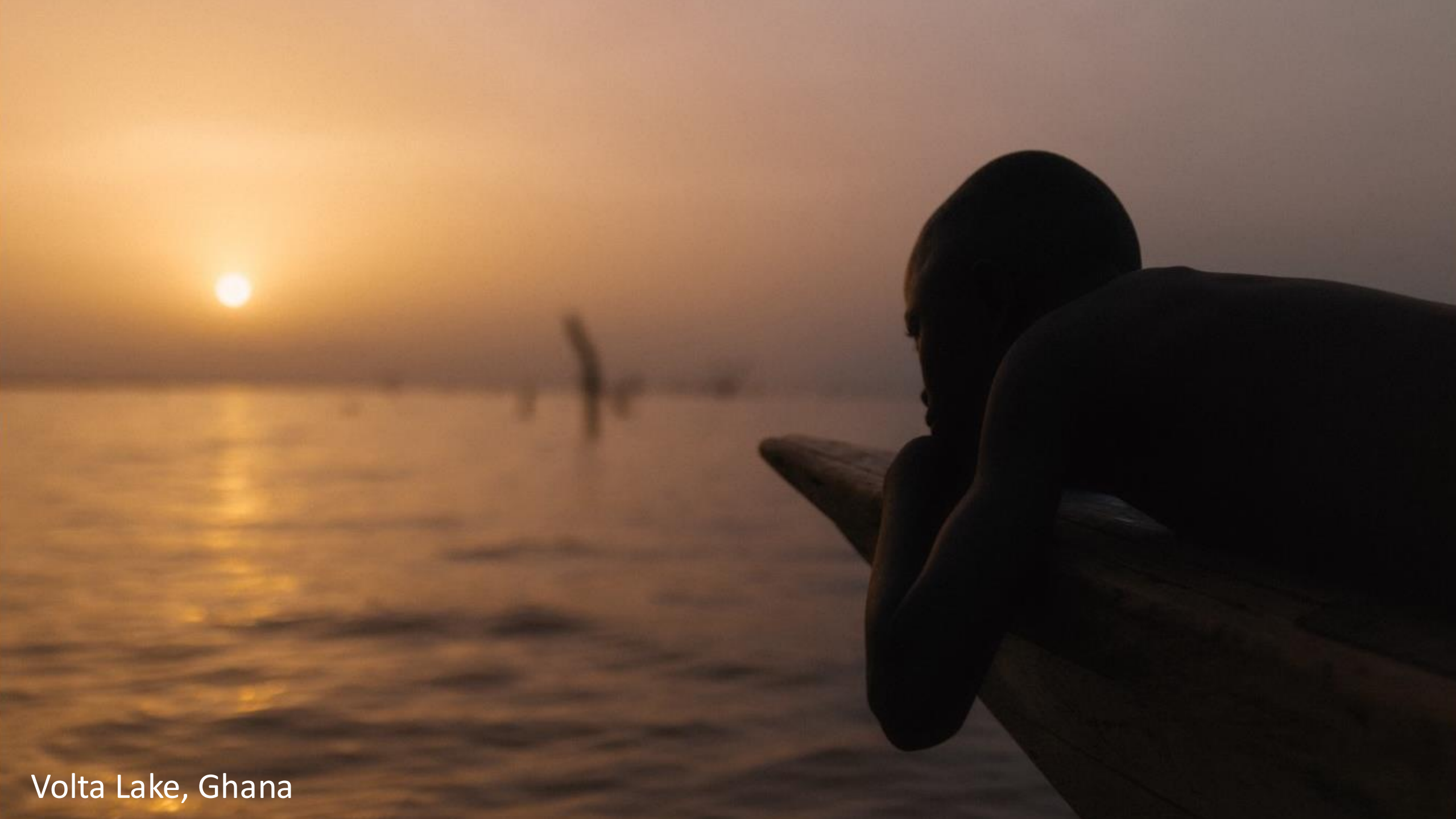
Volta Lake, Ghana